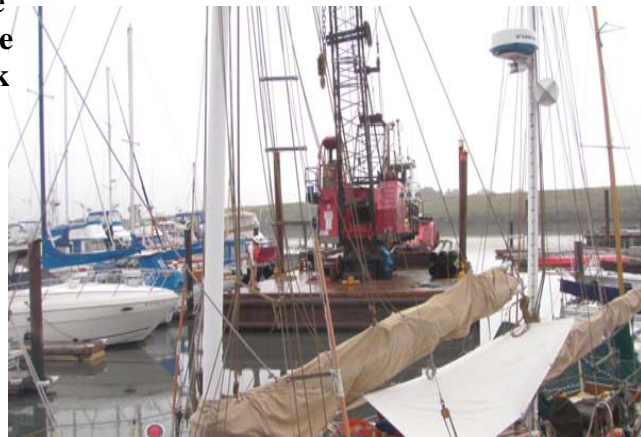
The dredging company platform pulls into position between B and C Docks to add sleeves to pilings.