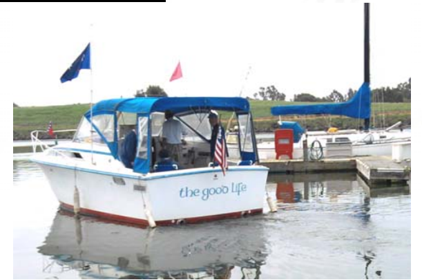
Race Committee Boat piloted by Ty Burkhart