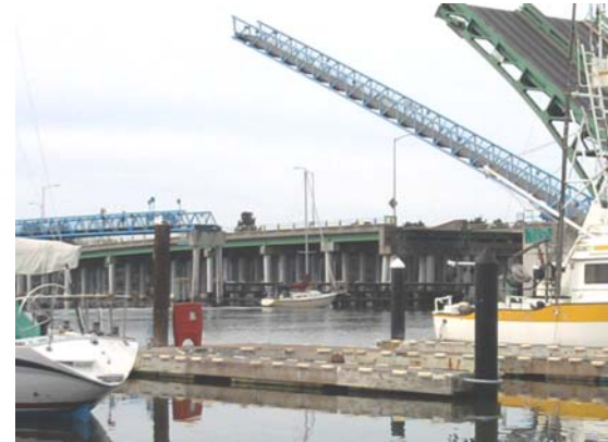
Free Spirit going under the Bay Farm Island Bridge